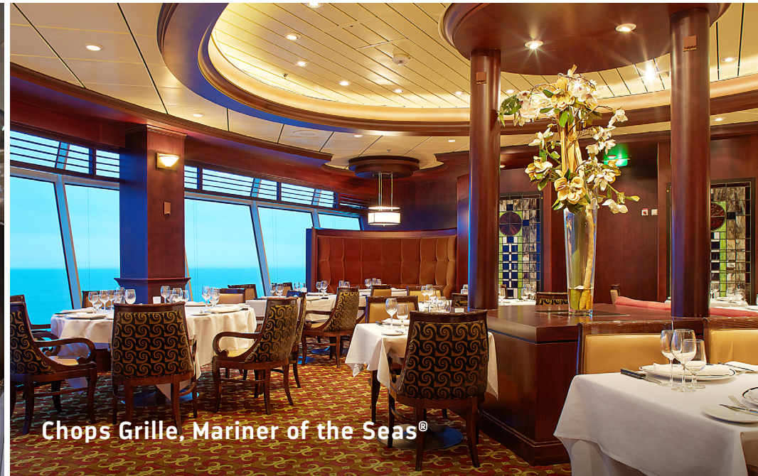
Chops Grille, Mariner of the Seas®