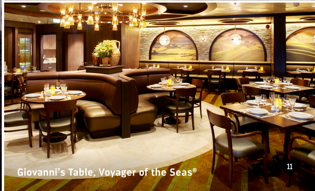
Giovanni's Table, Voyager of the Seas®