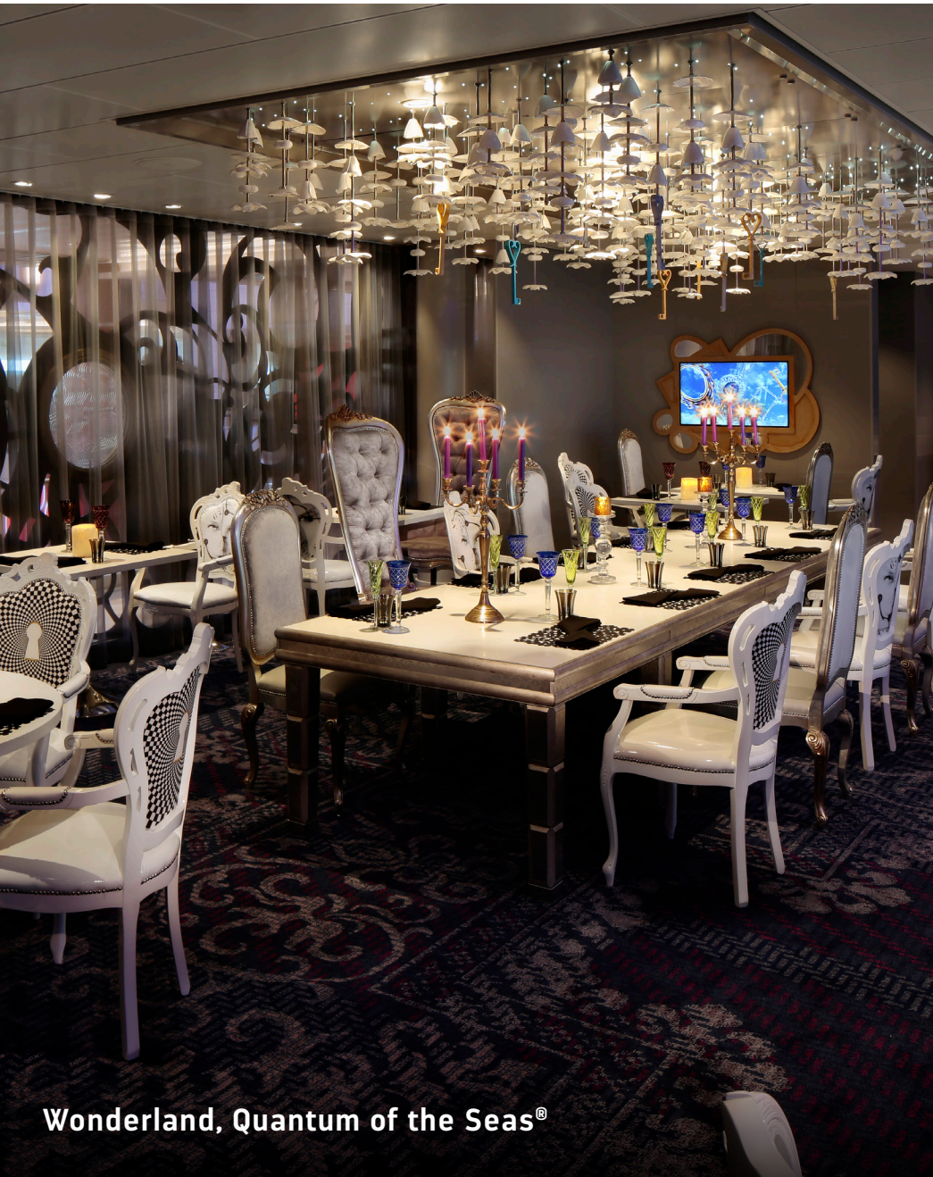
Wonderland, Quantum of the Seas®

Buyout fees may apply. Restaurant venues vary by ship.